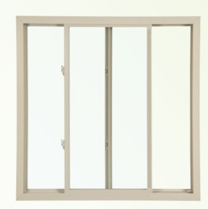
2-lite sliding window