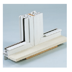
Choose the optional wood jamb extension and factory mull for simpler installation, without extra labor or materials.