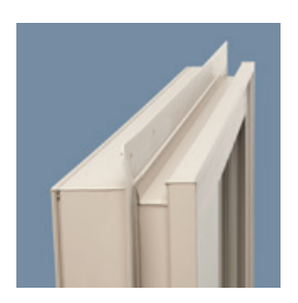
Thanks to the integrated J-Channel design, you can easily install vinyl siding around windows — without extra labor or materials.