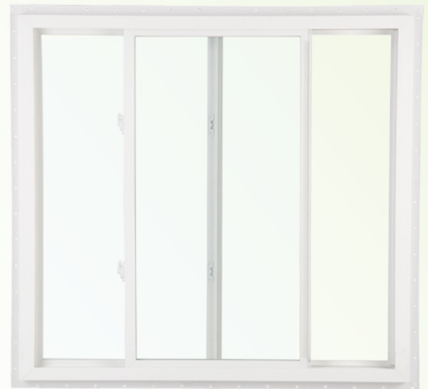
2-lite sliding window