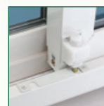
Foot Bolt Lock