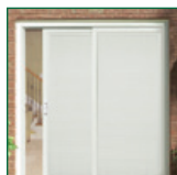
Controls light and privacy