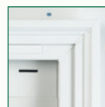
Brick Mould J-Channel