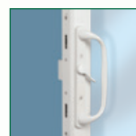
Dual Point Lock (Standard)