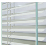
Never needs dusting and is safe for pets and children