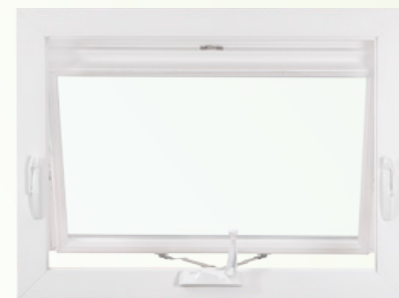
Single vent awning