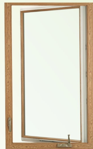
Single vent casement