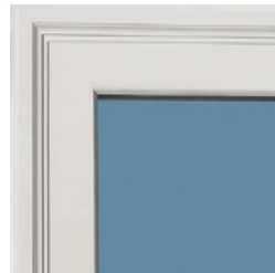
True brick mould exterior.