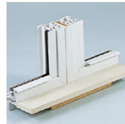
Choose the optional wood jamb extension and factory mull for simpler installation, without extra labor or materials. (Both options available for most windows.)