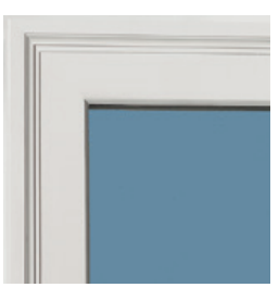
True brick mould exterior.