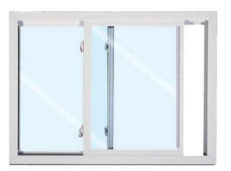
2 - LITE Slider Window