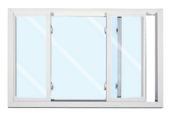
3 - L I T E Slider Window