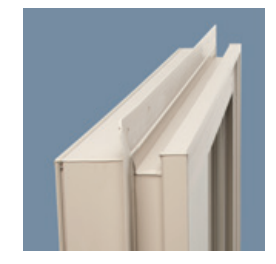
Thanks to the integrated J-Channel design, you can easily install vinyl siding around windows - without extra labor or materials.