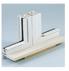
Choose the optional wood jamb extension and factory mull for simpler installation. without extra labor or materials.